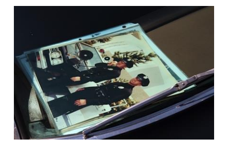
Goltz said "the parade is held Oct. 4 every year because 10-4 corresponds with the law enforcement radio code for message understood and was the classic sign-off used by Broderick Crawford".